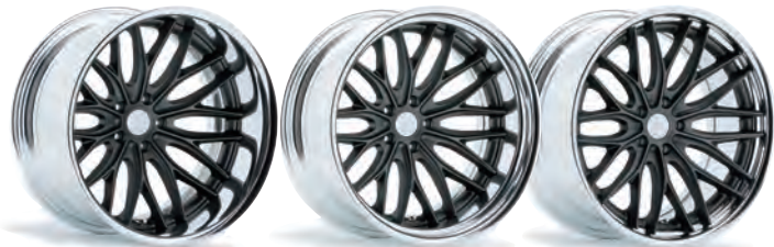
19" FLAT RIM / STANDARD SPOKE (Rim Depth 147mm)