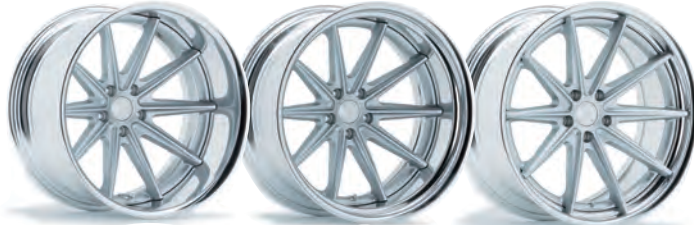
19" FLAT RIM / STANDARD SPOKE (Rim Depth 147mm)