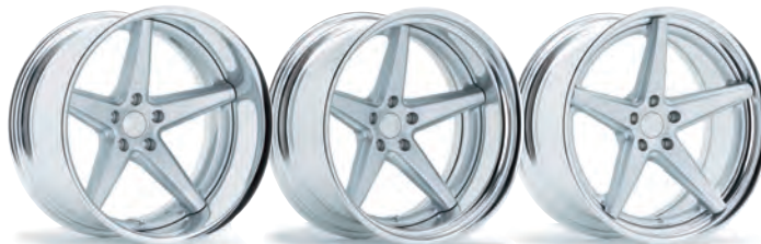
19"/21" FLAT RIM / STANDARD SPOKE (Rim Depth 147mm)