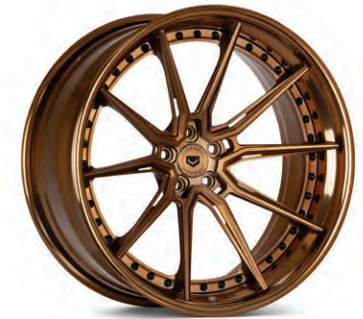
EVO-2R Forged 3-Piece Matte Brickell Bronze / Brickell Bronze