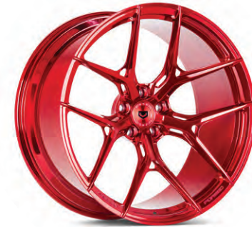
S21-01 Forged Monoblock Vossen Red

Prices are per wheel, all widths. For wheel and finishing options, refer to pages 100 - 105.