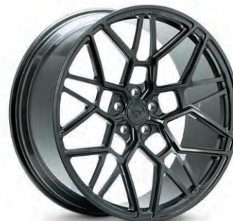
UV1 Gloss Gunmetal