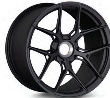
S21-01 Forged Monoblock Matte Gunmetal