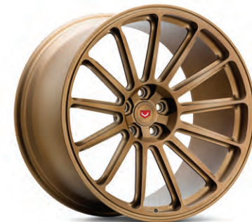
GNS-3 Forged Monoblock Matte Brickell Bronze