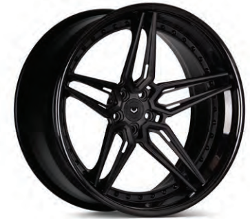
EVO-1R Forged 3-Piece Matte Midnight Smoke / Gloss Black