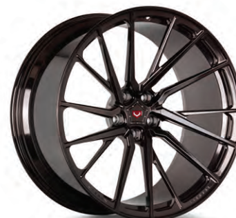
M-X4T Forged Monoblock Venetian Bronze