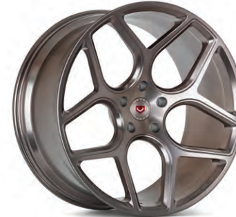
CG-205 Forged Monoblock Platinum