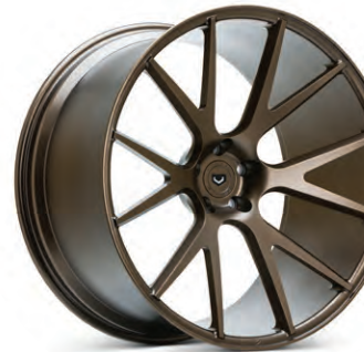
VPS-306 Forged Monoblock Satin Bronze *intini lip