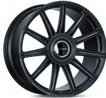
S17-12 Forged Monoblock Matte Midnight Smoke