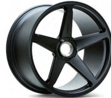
GNS-1 Forged Monoblock Satin Black

Prices are per wheel, all widths. For wheel and finishing options, refer to pages 100 - 105.