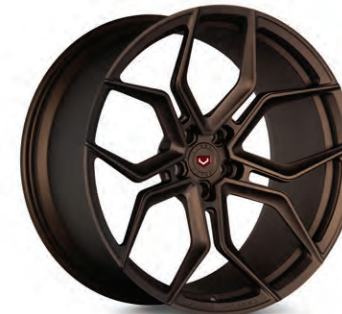
EVO-3 Forged Monoblock Bronzino