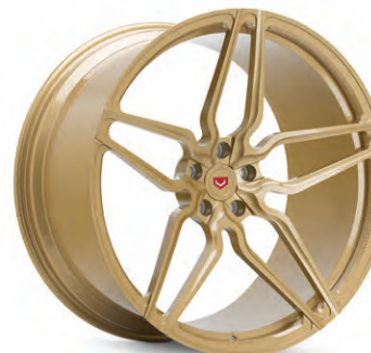
HC-2 Forged Monoblock Gloss Gold