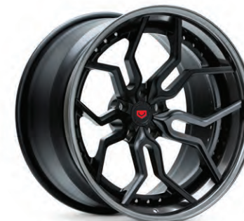
HC-3 Forged 3-Piece Satin Black / Dark Smoke