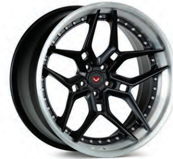
EVO-4 Forged 3-Piece Satin Black / Gloss Clear