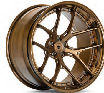
S21-01 Forged 3-Piece Matte Brickell Bronze / Brickell Bronze