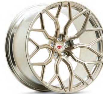
S17-01 Forged Monoblock Patina Gold