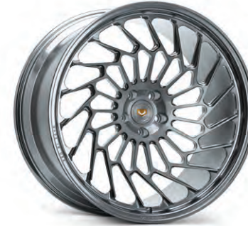
ML-R2 Forged Monoblock Dark Smoke