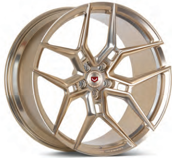
EVO-4 Forged Monoblock Patina Gold