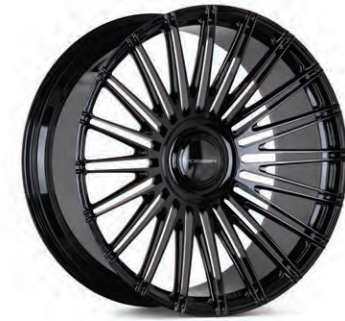
S17-14 Forged Monoblock Gloss Black