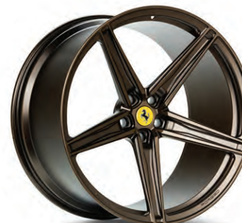
M-X5 Forged Monoblock Satin Bronze