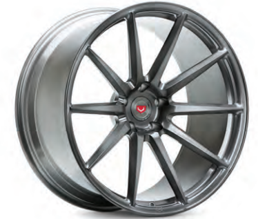
VPS-310 Forged Monoblock Gloss Gunmetal