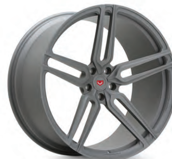
HC-1 Forged Monoblock Textured Gunmetal