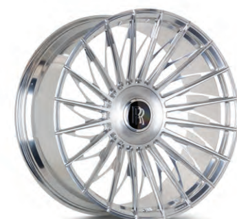
S17-15T Forged Monoblock Gloss Clear