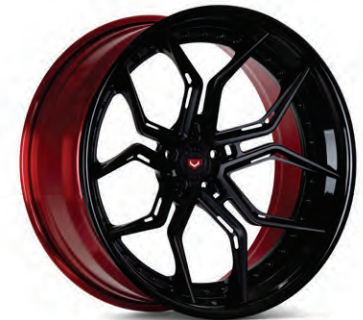
EVO-3R Forged 3-Piece Satin Black / Gloss Black