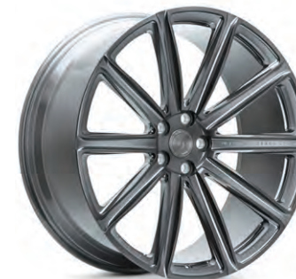
UV2 Dark Smoke