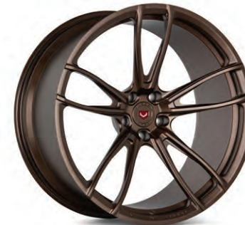
S17-06 Forged Monoblock Satin Bronze