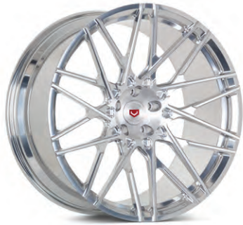
S17-07 Forged Monoblock Gloss Clear