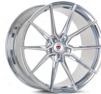
EVO-2R Forged Monoblock Gloss Clear