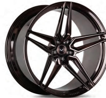
EVO-1 Forged Monoblock Venetian Bronze