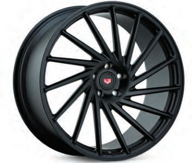
VPS-305T Forged Monoblock Satin Black