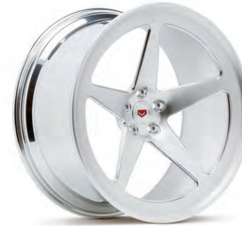
LC-101 Forged Monoblock Gloss Clear