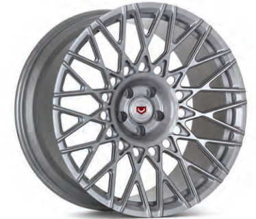
ERA-1 Forged Monoblock Light Smoke