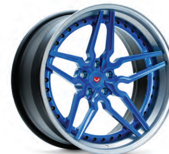
HC-2 Forged 3-Piece Fountain Blue / Space Grey