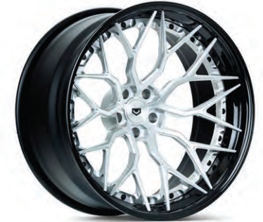
S17-01 Forged 3-Piece Gloss Clear / Gloss Black