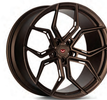
EVO-3R Forged Monoblock Bronzino