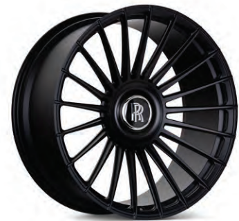
S17-13 Forged Monoblock Satin Black