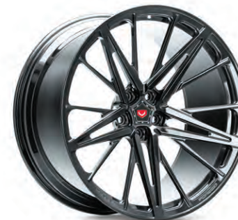
M-X6 Forged Monoblock Midnight Smoke