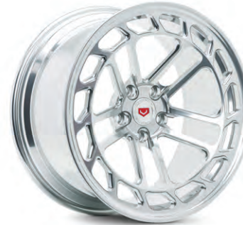
LC2-C1 Forged Monoblock Gloss Clear