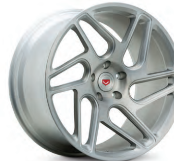
CG-209T Forged Monoblock Light Smoke