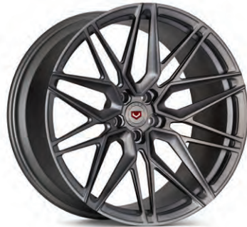
EVO-5 Forged Monoblock Stealth Grey