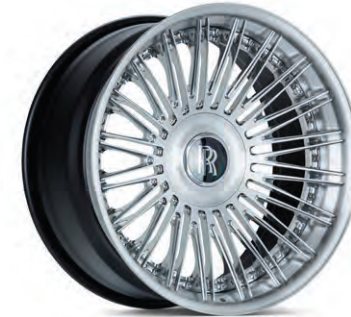
S17-14 Forged 3-Piece Gloss Clear / Gloss Clear