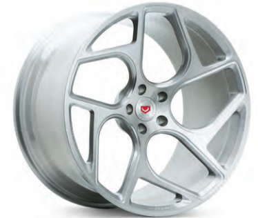
CG-205T Forged Monoblock Light Smoke