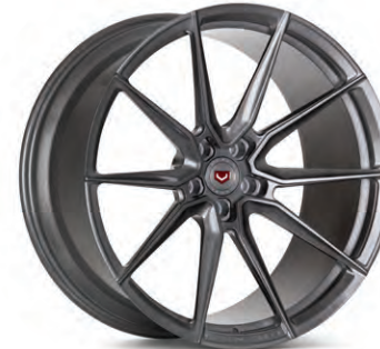
EVO-2 Forged Monoblock Dark Smoke