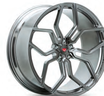
HC-3 Forged Monoblock Dark Smoke