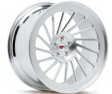
LC-106T Forged Monoblock Gloss Clear