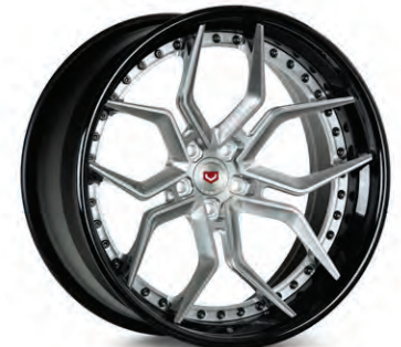
EVO-3 Forged 3-Piece Light Smoke / Gloss Black