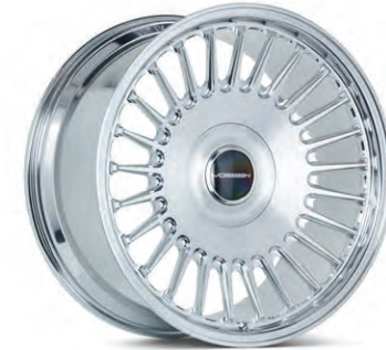
ML-R1 Forged Monoblock Gloss Clear