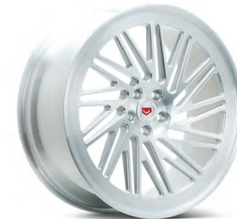
LC-105T Forged Monoblock Gloss Clear