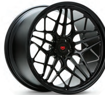
ML-R3 Forged Monoblock Satin Black

Prices are per wheel, all widths. For wheel and finishing options, refer to pages 100 - 105.