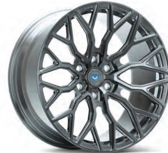
S17-02 Forged Monoblock Gloss Gunmetal