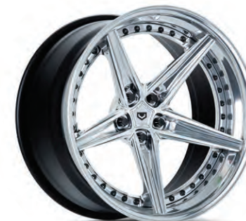
M-X5 Forged 3-Piece Gloss Clear / Gloss Clear