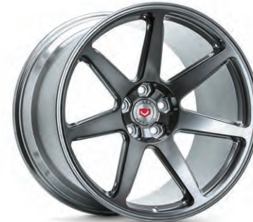
GNS-2 Forged Monoblock Dark Smoke