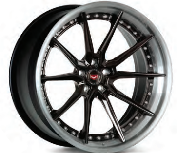
EVO-2 Forged 3-Piece Venetian Bronze / Light Smoke