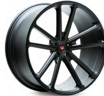
CG-203 Forged Monoblock Satin Black