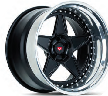
ERA-2 Forged 3-Piece Satin Black / Gloss Clear