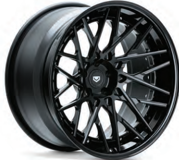
S17-07 Forged 3-Piece Satin Black / Gloss Black