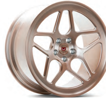
LC-104 Forged Monoblock Vintage Rose