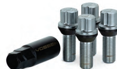
LUG BOLT LOCKS