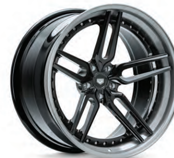
HC-1 Forged 3-Piece Midnight Smoke / Light Smoke