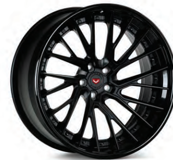
EVO-6T Forged 3-Piece Satin Black / Gloss Black