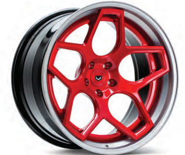
CG-205 Forged 3-Piece Vossen Red / Space Grey