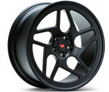
LC-104T Forged Monoblock Satin Black