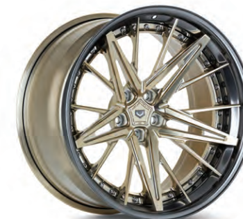
M-X6 Forged 3-Piece Patina Gold / Dark Smoke