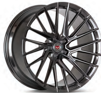
EVO-6T Forged Monoblock Dark Smoke