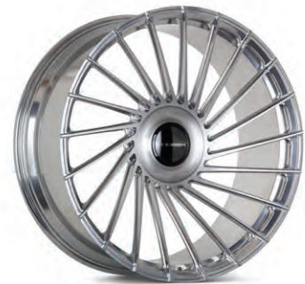
S17-13T Forged Monoblock Light Smoke