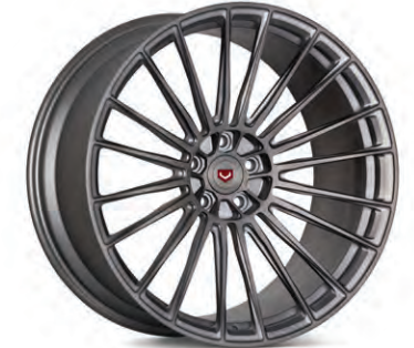
S17-04 Forged Monoblock Stealth Grey