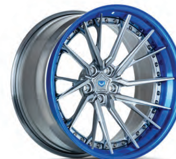
M-X4T Forged 3-Piece Light Smoke / Fountain Blue