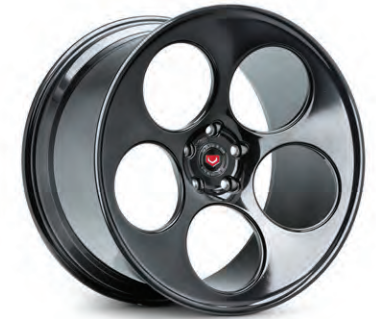
LC-103 Forged Monoblock Midnight Smoke