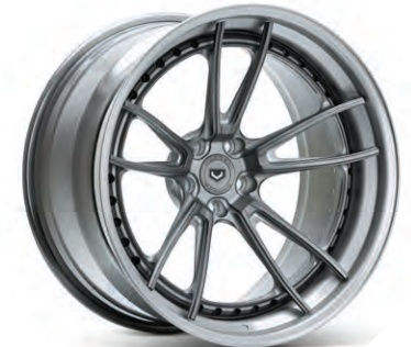
S17-06 Forged 3-Piece Space Grey / Light Smoke