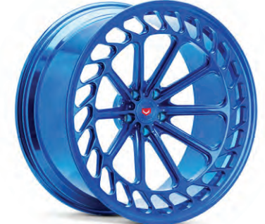
LC2-B2 Forged Monoblock Fountain Blue