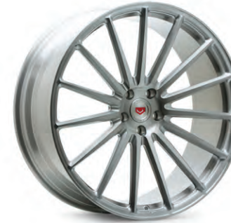
VPS-305 Forged Monoblock Dark Smoke