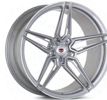
EVO-1R Forged Monoblock Gloss Clear