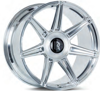
S17-11 Forged Monoblock Gloss Clear