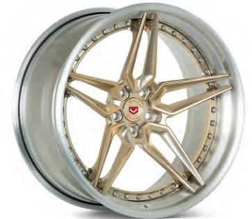
EVO-1 Forged 3-Piece Patina Gold / Gloss Clear