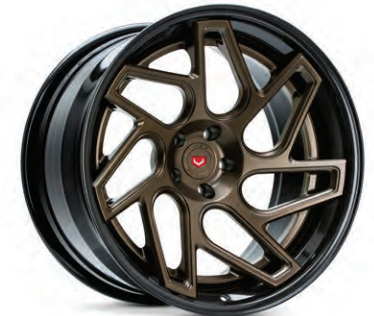
CG-209T Forged 3-Piece Satin Bronze / Gloss Black