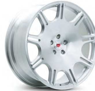
VPS-312 Forged Monoblock Gloss Clear