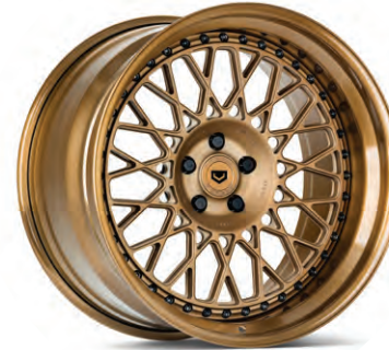
ERA-1 Forged 3-Piece Matte Brickell Bronze / Brickell Bronze