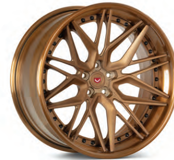
EVO-5 Forged 3-Piece Matte Brickell Bronze / Brickell Bronze