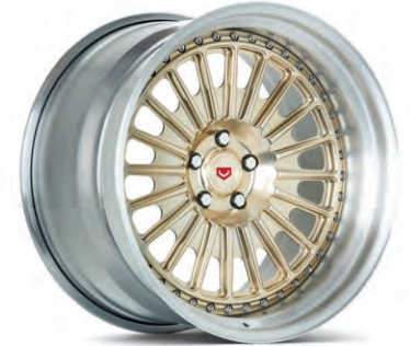
ERA-3 Forged 3-Piece Patina Gold / Gloss Clear