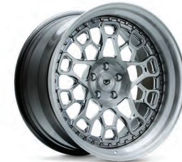
ERA-4 Forged 3-Piece Light Smoke / Light Smoke